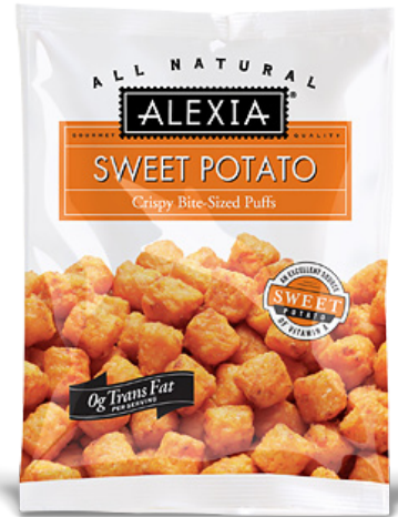
PACKAGE SIZE: 200Z

Crispy outside. Soft inside. Sweet all around. It's the next deliciously logical step for the great sweet potato.